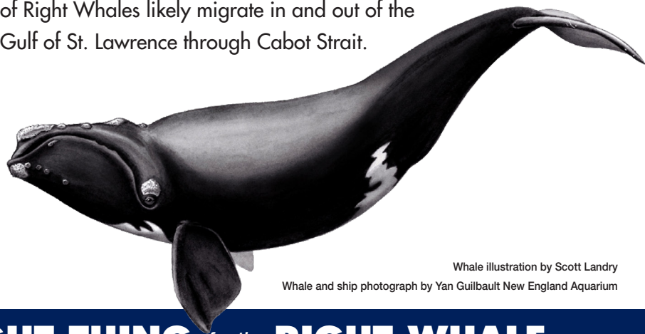
Whale illustration by Scott Landry Whale and ship photograph by Yan Guilbault New England Aquarium

Between April 16 and June 24, and again between September 3 and November 15, which is when the majority of Right Whales likely migrate in and out of the Gulf of St. Lawrence through Cabot Strait.